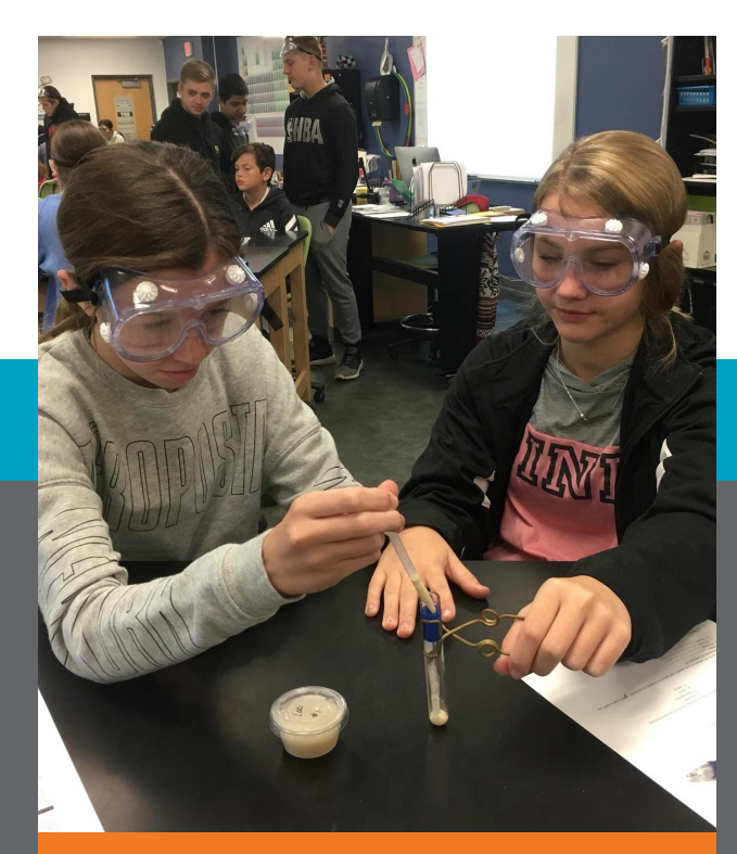
NTN School Within A School 327 Students